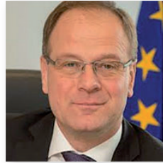
Navracsics Tibor Minister for Regional Development