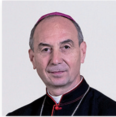
György Udvardy Archbishop of Veszprém